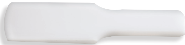
920475 G C